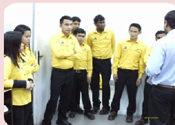
QZS- Enma Mall staff

QZS continues to provide trainings and toolbox talks to its staff to sustain the quality of service.